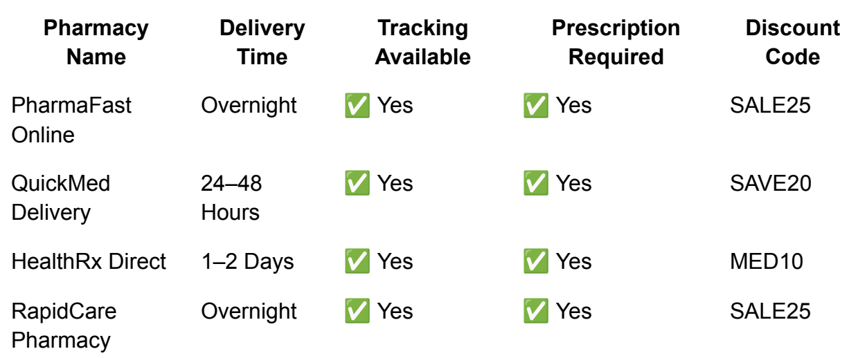
Table: Comparison of Online Hydrocodone Pharmacies

This table highlights some of the best online pharmacies offering Hydrocodone with easy tracking and overnight delivery.